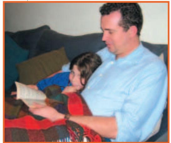
Warm and cosy: not just a winter's tale

Households can benefit from new funding to extend the Government's Clear Skies initiative for a further year, bringing total funding to £12.5 million. Clear Skies grants are available for a variety of renewable technologies where communities can get up to 50% of capital costs up to a maximum of £10,000. For further information see www.clear-skies.org or 08702 430 930. For details of the Government action plan on Fuel Poverty go to www.defra.gov.uk .